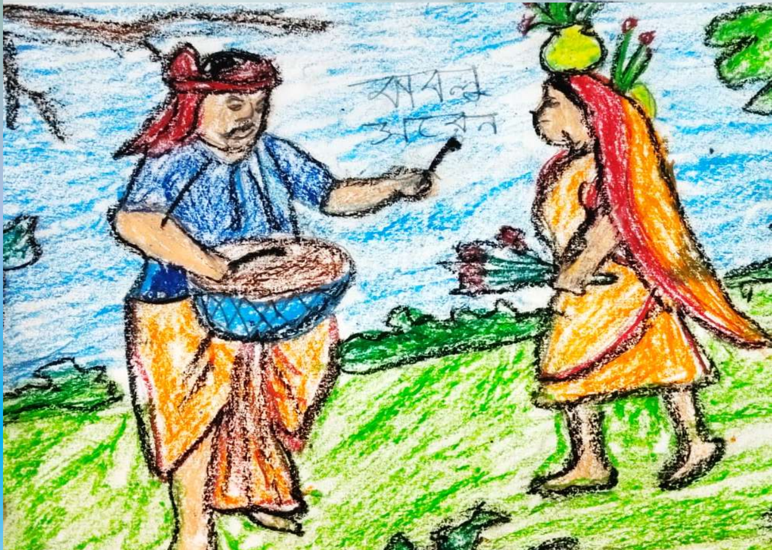
Drawings by the beneficiary students of Pathshala, Bolpur